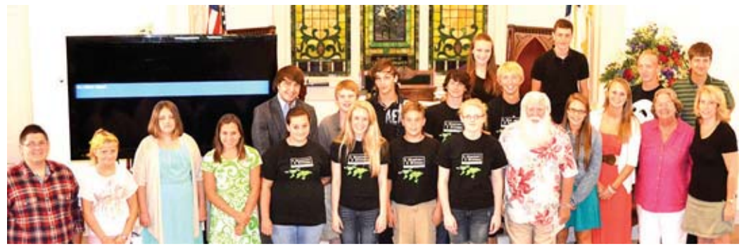
Irvington Baptist Church tweens, teens and chaperones lead worship service.