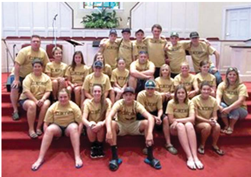
Coan Baptist Church Youth above recently participated in a mission camp.