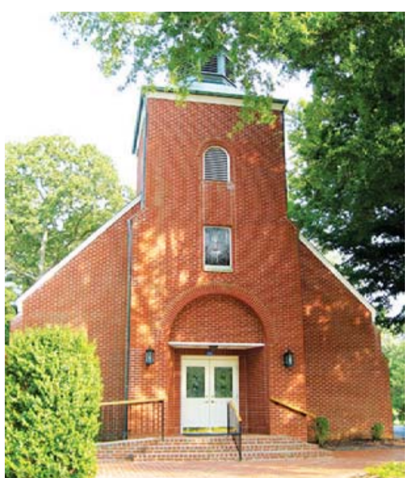
St. Francis de Sales Catholic Church