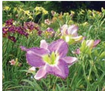
A garden of award-winning daylilies will greet buyers at the Northumberland Public Library Daylily Sale.