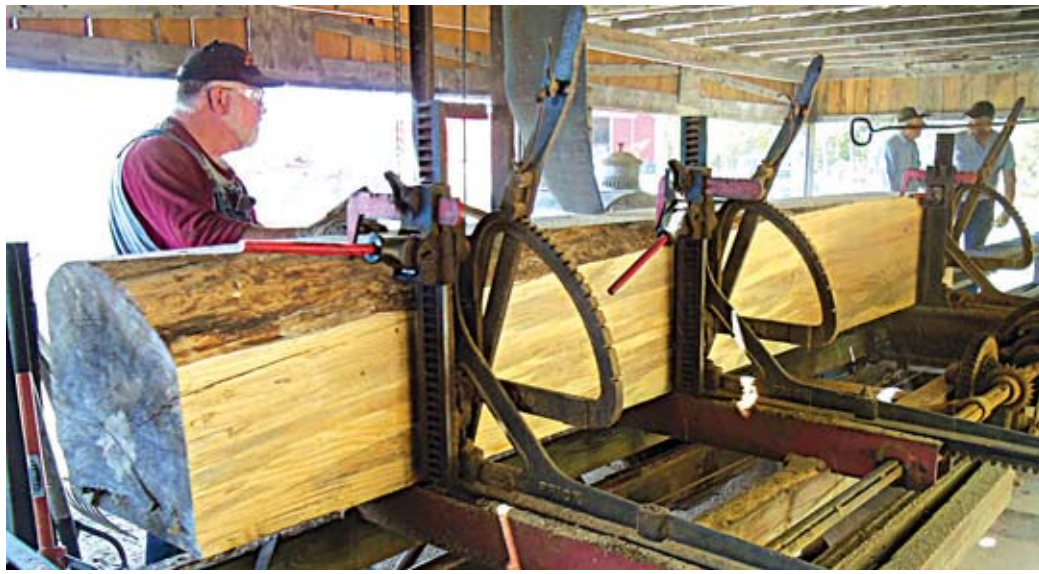
Demonstrations on the Frick sawmill, shown above, will be available on Threshing Day June 28.

The concert will begin at 7 p.m. on the Grace Episcopal Church lawn, 303 South Main Street, Kilmarnock. The public is urged to bring chairs and picnics. Grounds open at 6 p.m.