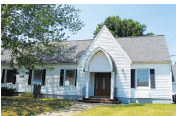
Seventh Day Adventist Church