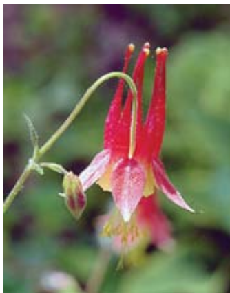
An Eastern red columbine in bloom.

be used in natural woodlands or in flower borders. If a plant likes its location, it will reseed to form a large grouping. Plants are also easy to start from seed but will not flower until the second year after sowing.