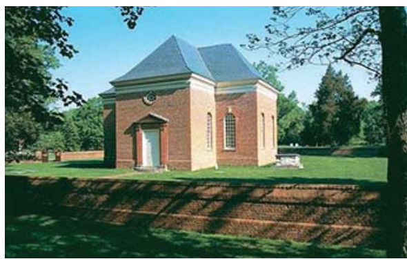
Historic Christ Church

6:30 p.m., Prayer Service 7:30 p.m., Choir Practice