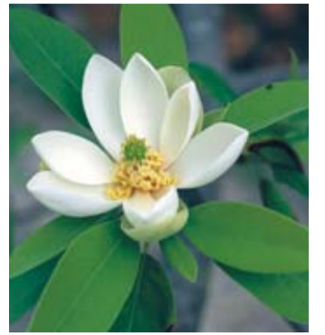
Sweetbay magnolia flower

Sweetbay magnolia tolerates shade but blooms best with more sun. Unlike most other magnolias, it thrives in wet places and will also grow