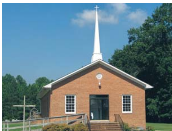
Galilee United Methodist Church