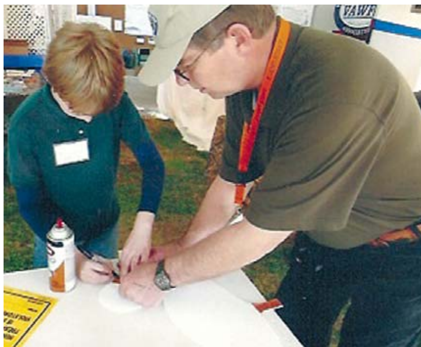
A member of the Virginia Waterfowler's Association works with a youngster at last year's show.