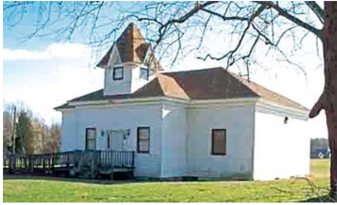
The Rosenwald School at Kremlin

The Rosenwald rural school building program was a major effort to improve the quality of public education for African-Americans in the early 20th century in the South. In 1912, Julius Rosenwald, the president of Sears, Roebuck and Company, gave Booker T. Washington permis-