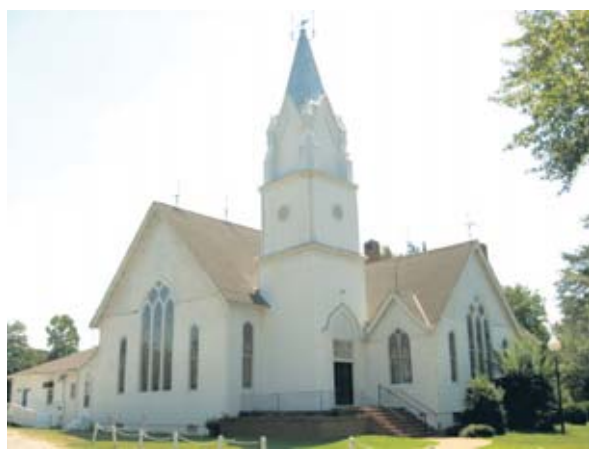
New St. John's Baptist Church