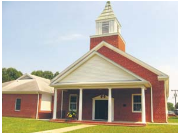
Mt. Olive Baptist Church