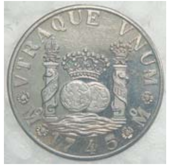
The Spanish Milled Dollar (above), British Gold Guinea, Rosa Americana Twopence and the Virginia Halfpenny will be discussed in the money portion of "A History of Commerce in Middlesex County," a new exhibit sponsored by C&F Bank at the Middlesex County Museum.