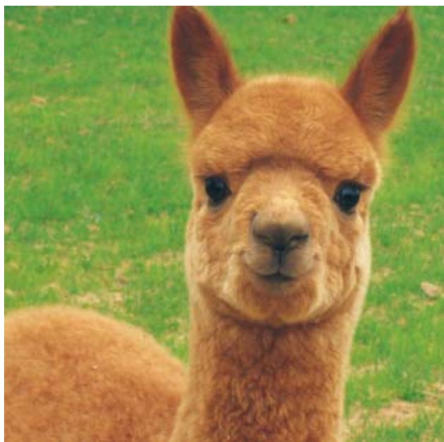
Visitors to Evening Skies Alpaca Farm will be greeted by alpacas.

The tour is self-guided; however, Northern Neck NeckRide.org will provide transportation to five