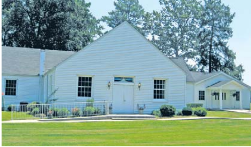
Calvary Pentecostal Tabernacle, Weems