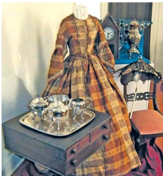
Selections from "Lifestyles of the 1860s" exhibit