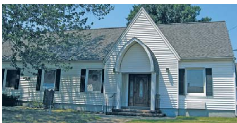
Seventh Day Adventist, Kilmarnock